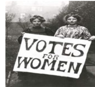
100 years of women's right to vote