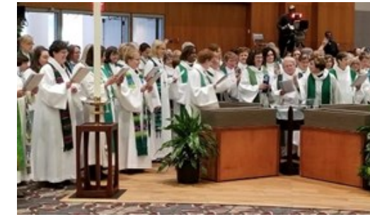
50 years of Lutheran women